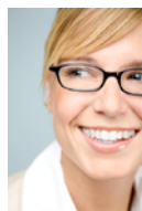
Photo does not show entire face and shoulders